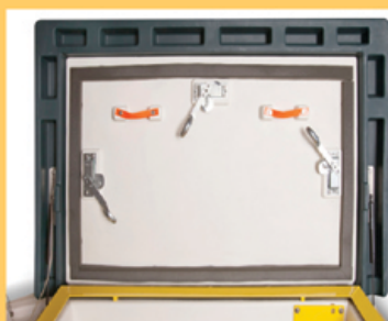
Heavy-duty locking mechanisms at three points