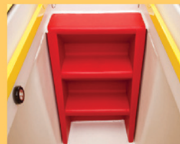
Molded 3-step ladder with non-skid

The main part of the shelter is formed from one-piece of polyethylene---a nearly indestructible material---in a unique process called rotational molding. Thick, half-inch double wall foam filled construction makes the ISS more durable than concrete and fiberglass, which can crack with settling. And unlike expensive steel shelters, polyethylene will never rust or corrode.