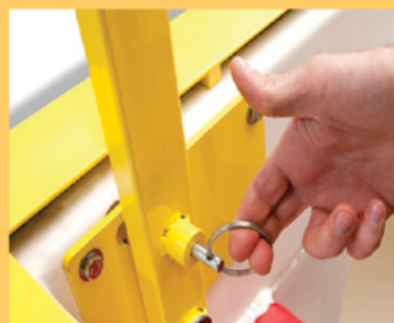
Extending handrail locks into place