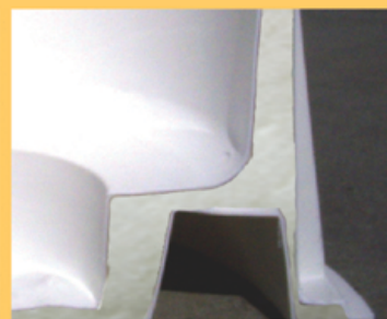
Half-inch molded polyethylene double-wall foam filled construction

Access: Door molded from polyethylene, consisting of 5 separate walls; Texas Tech Wind Labs tested and exceeds both FEMA 320 and FEMA 361 standards. Door is available in most standard colors and is complete with 2 gas assisted shocks for ease of lifting.