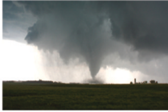
On the cover: A rotating funnel cloud, such as the one shown here, is perhaps the strongest indication that a violent tornado is about to form in the immediate area.